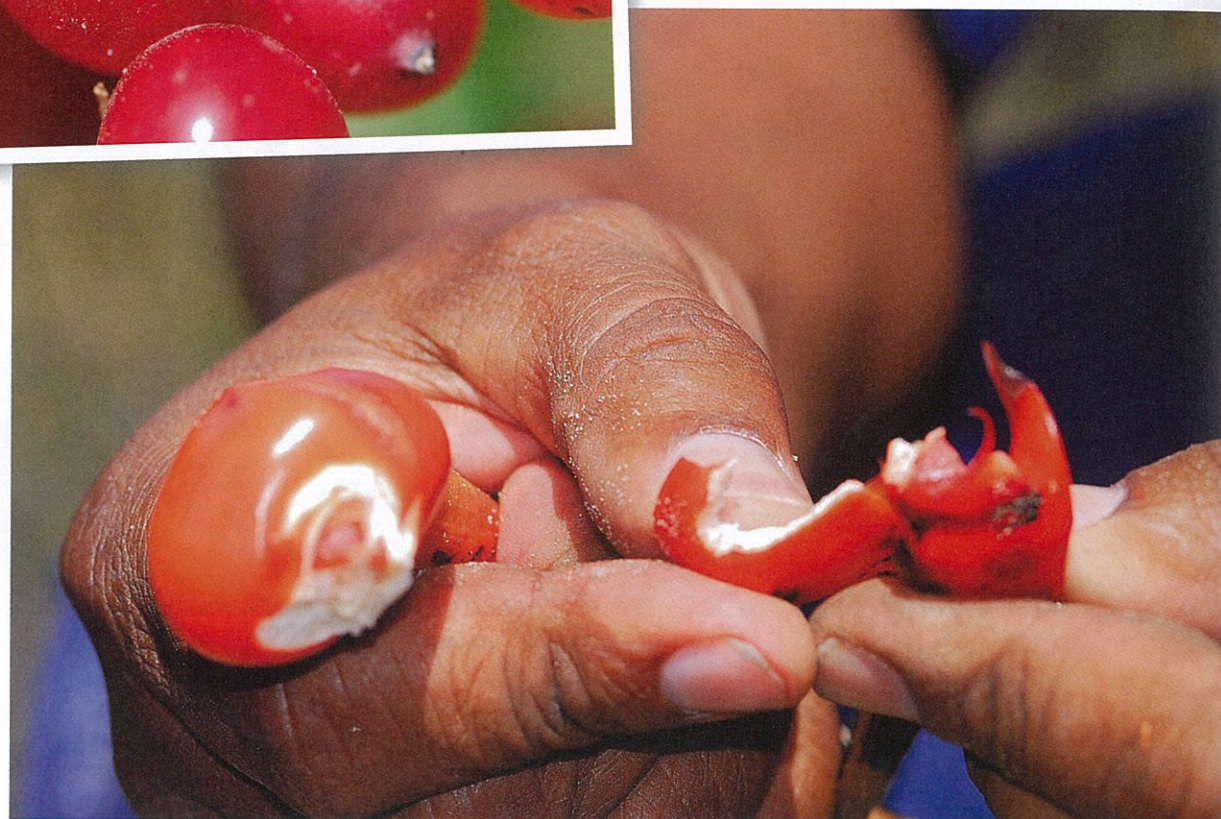
BORRN (NATIVE BUSH ONION)

distribution alternatives. Most, however, lack funds for marketing and education and are still to instigate a strong Indigenous presence in the workforce.