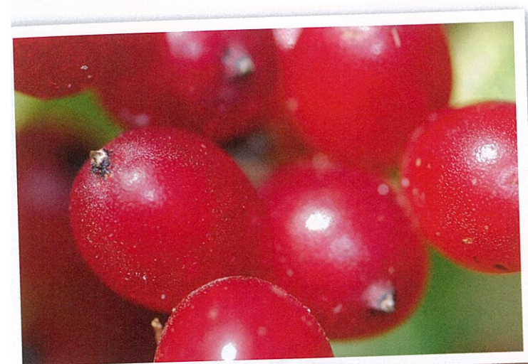
NGUMP (BUSH GRAPES)